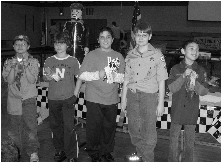
Derby winners pose with Cubbie

Sibling and non-scout cars are also welcome to compete.