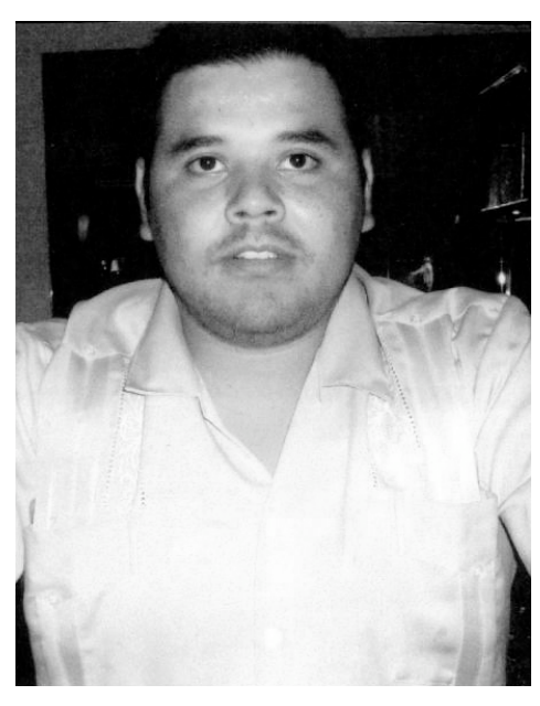
What got you into Scouting?

I received a flyer in my son's school is anything you wanted to see or build folder about a week after he started 1st as a kid that you never got a chance grade. He was new in school so we to, like myself, this is the way you can decided it would be a great way for him make it possible. What could be more to get to meet new friends. So we signed enjoyable than that? him up. That's what got my foot in the