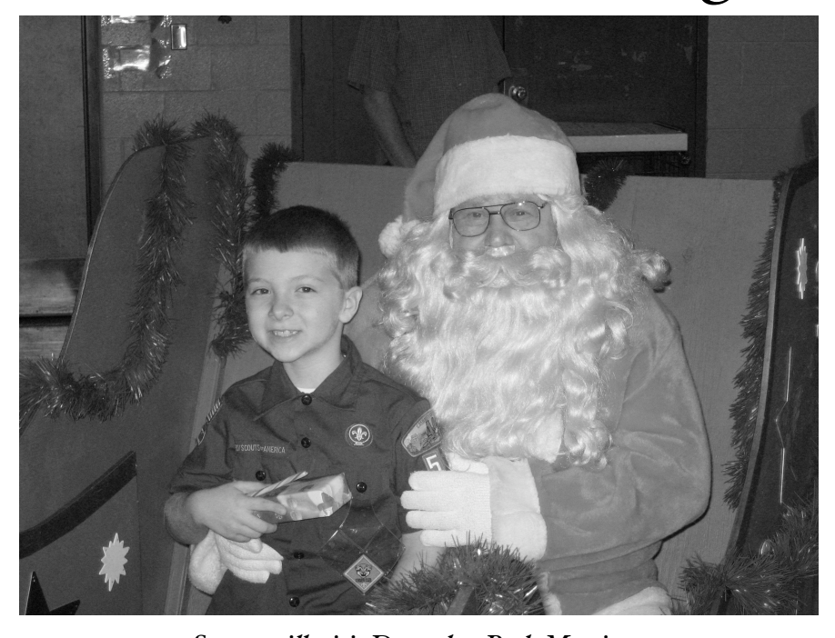
Santa will visit December Pack Meeting

Santa Claus will be joining the Cubs Scouts at our December pack meeting.