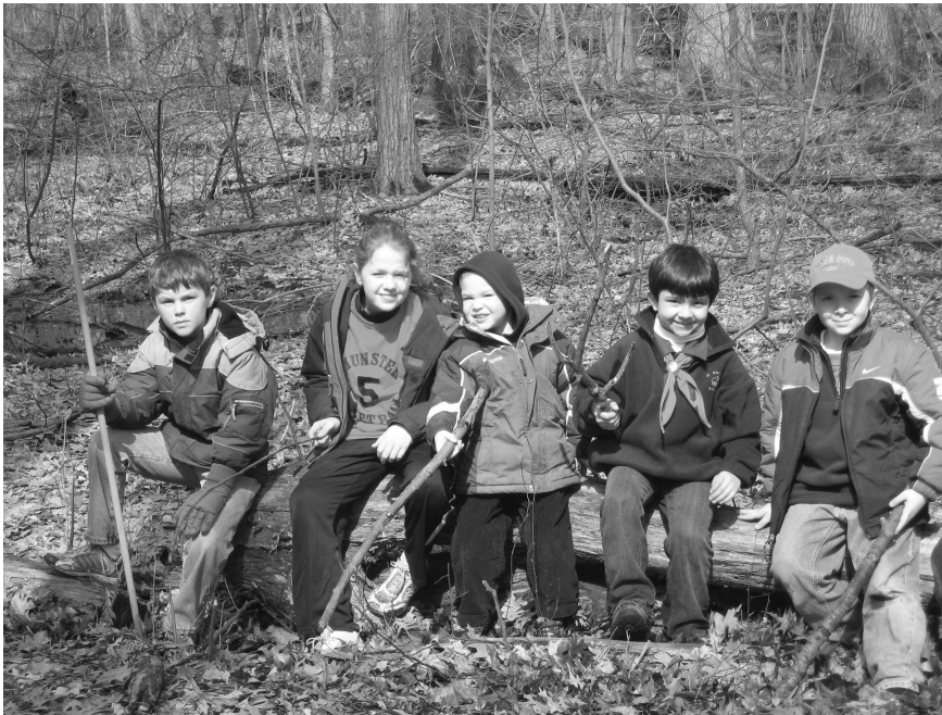
Scouts and siblings take a break during a recent hike

Come join the Scouts on Saturday, November 1st for a morning hike at Deep River County Park. The park is located off of Route 30, 2 miles East of Southlake Mall.