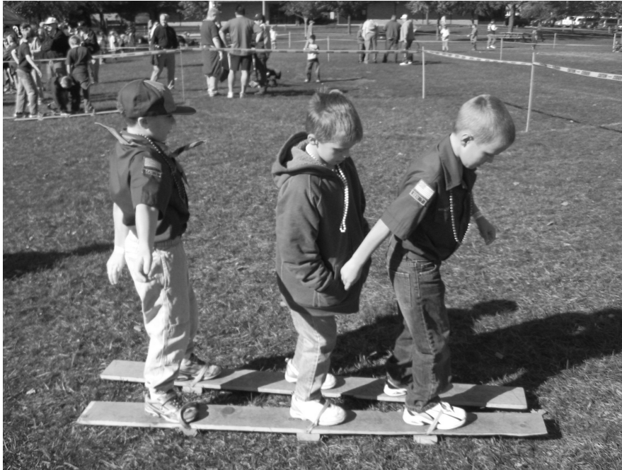
Adventure Day - Buddy Boards